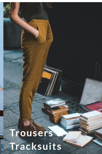
Trousers & Tracksuits