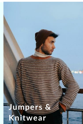
Jumpers & Knitwear