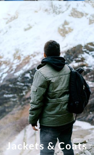
Jackets & Coats