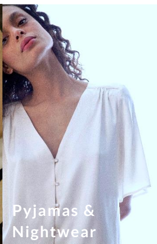
Pyjamas & Nightwear