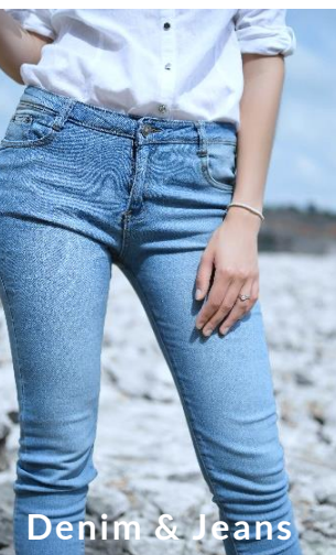
Denim & Jeans