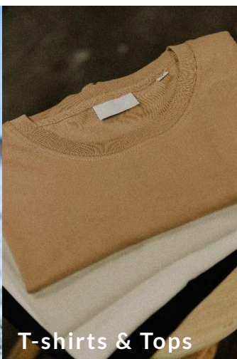
T-shirts & Tops