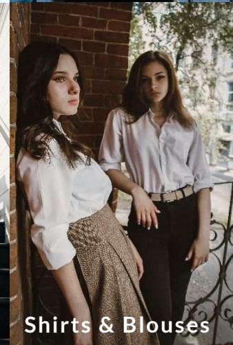
Shirts & Blouses